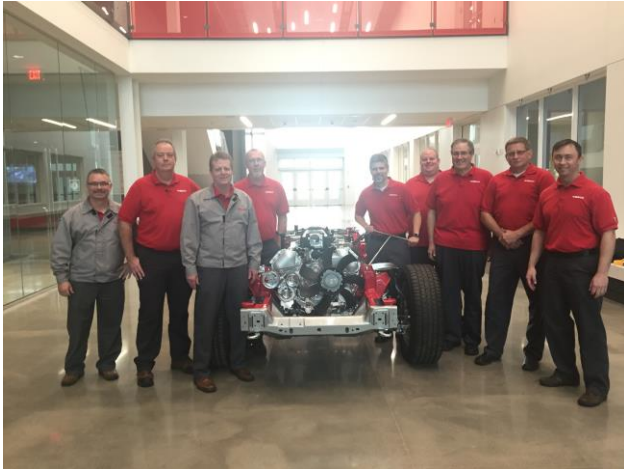
Members of the Nissan North America Energy Team

environmental team then developed an environmental and energy management policy (nationally applicable) and set objectives for improving its energy performance.