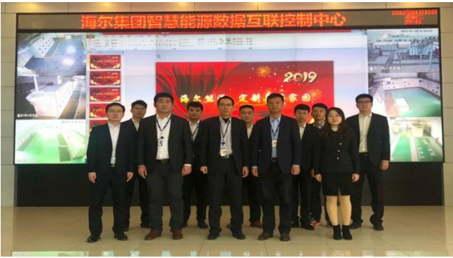
Open intelligent energy management platform based on energy management system construction