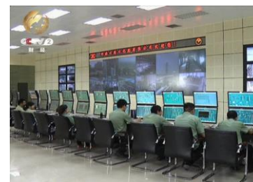
Figure3 Production Dispatch Center

The corporation had set up a leading group for energy conservation and carbon reduction at the company level, established an energy management center, built an energy management system, implemented demonstration projects of the energy management center, and continuously improved energy management through technological innovation and QC tackling key problems. XLX has currently formed a systematic, standardized, standardized, visual energy management model with all the staff participating in energy saving.