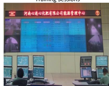
Figure2 Energy Management Center