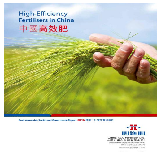
Figure4 Environmental, Social and Governance Report

Xinlianxin Shenleng Energy Co., Ltd is the first enterprise in Henan province to conduct carbon capture, utilization and storage (CCUS). The corporation is the first listed company in Henan province to disclose "greenhouse gas emission" information. The 2016 environmental, social and governance report released by XLX covered greenhouse gas emissions and has been disclosed to the whole society on the Hong Kong stock exchange. As the first carbon emission management demonstration enterprise, the corporation held the signing ceremony and training meeting of the national carbon emission management demonstration project in 2017, becoming the first carbon emission management demonstration enterprise in Henan province.