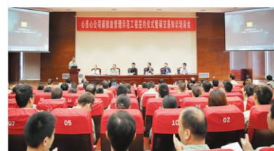
Figure1 Carbon Emissions Demonstration Project Training Sessions