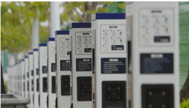
Figure 4 The charging piles