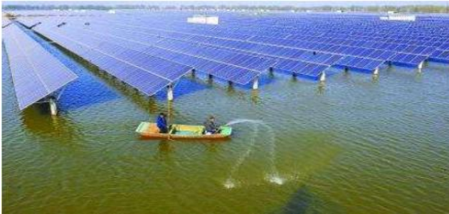
Figure 9 Floating photovoltaic power station

② Adopted the model of EPC business to build solar photovoltaic power stations and charging piles, and carried out energy-saving transformation of lighting systems.