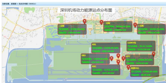
Figure 5 Energy digital management system