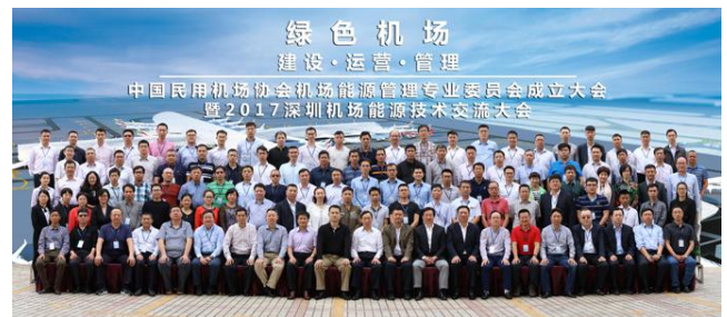
Figure 6 Energy technology exchange conference

In 2019, Shenzhen Airport (group) Co., Ltd. will also organize managers to attend the training of registered energy managers in the United States.