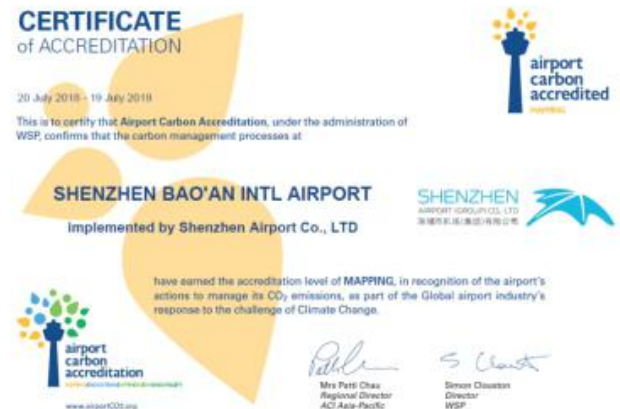
Figure 10 Airport Carbon Accreditation certificate