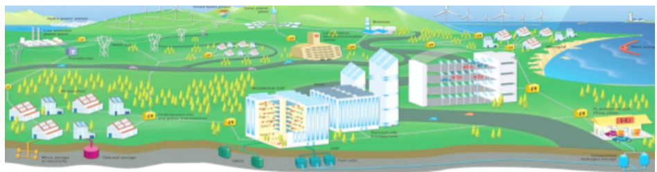
Future network vision.

The implementation of smart electricity grids enabled by digital technologies is a key building block for ensuring affordable, reliable, sustainable, and secure energy systems that can effectively integrate and balance a diverse range of energy sources and uses.