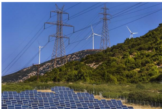
Clean Energy Solutions Center Expands Policy Assistance and

At COP21 in Paris, U.S. Energy Secretary Ernest Moniz announced, alongside California Governor Edmund G. Brown Jr., that the United States will host the seventh Clean Energy Ministerial (CEM7) in San Francisco, California, on 1–2 June 2016. The annual meeting of energy ministers and other high-level delegates will provide an opportunity for the major economies to collaborate on solutions that advance clean energy globally and demonstrate tangible follow-up actions to COP21. Learn more about CEM7.