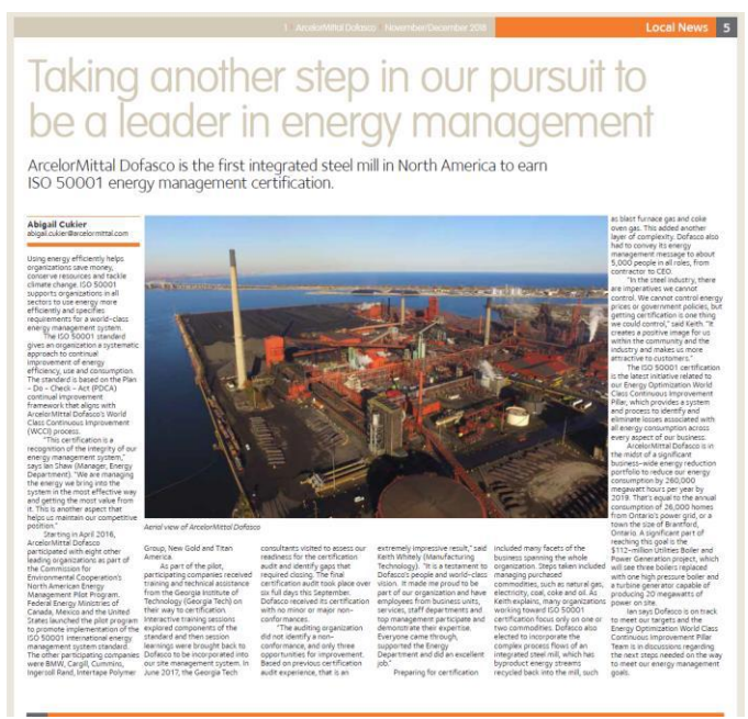
Figure 2 – Letting the public know!

In retrospect, the journey towards ISO 50001 certification was rewarding and insightful. However, the one true wish would be to begin the implementation journey sooner. With certification to ISO 50001 complete, the future of energy performance improvement at ArcelorMittal Dofasco can now take on another interpretation, one where the day will not be judged by the harvest we reap, but by the seeds that we plant.