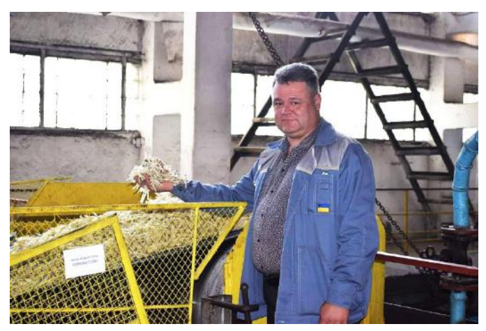
"Take care of the environment and save energy the way you like your own business and how you care for your children"

by UNIDO to facilitate the management of the EnMS using regression analysis to normalize baseline consumption, namely the use of regression analysis, has been taken.