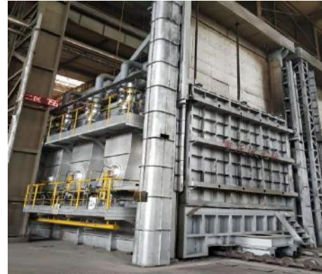
Regenerative Natural Gas Furnace after Retrofitting

7. Through the establishment of the Energy Management System, the procurement process of Energy-consuming Equipment was reformulated, and the Procurement Dept. is required to purchase Energy-consuming Equipment after receiving the Joint Evaluation by both of Equipment Support Dept. and Energy Supply Company.