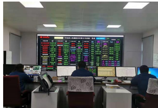
"Internet +" Energy Control Center