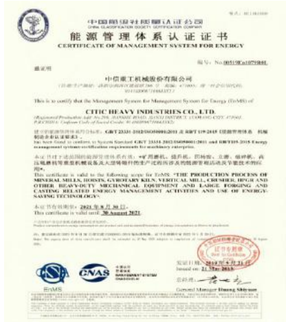
Certificate of Management System for Energy

2. In the bidding publicity materials, we promote the "Certificate of Management System for Energy" to our customers.