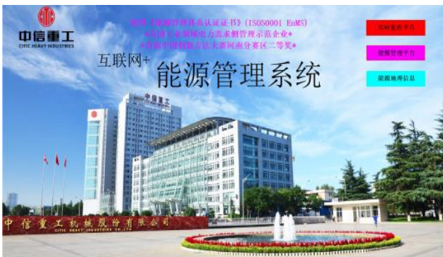
The Main Interface of the Display of Energy Management and Control Center

3. On the main interface of the display of the Energy Management and Control Center, the Certificate of Management System for Energy is published. The company often organized customers to visit the Energy Management and Control Center, and introduced the experience gained from the operation of the Energy Management System.