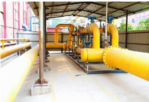
Gas Regulating Station