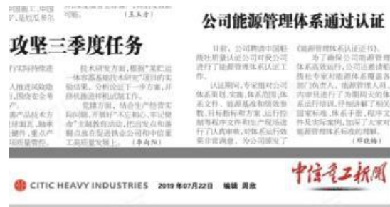
News Column of the Enterprise's Website

1. CITIC HIC obtained the "Certificate of Management System for Energy" on May 21st, 2019, and announced it in the news column of the enterprise's website on July 22nd.