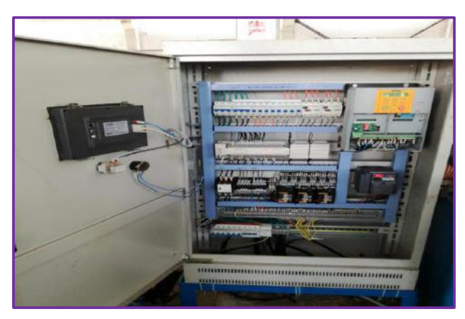
Equipment frequency conversion transformation