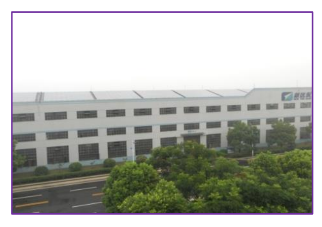
Construction of photovoltaic power station

The intelligent workshop project has been implemented for two years, and there is still much room for improvement. In the next 1-2 years, we will continue to work with Siemens to further explore the potential. APS intelligent production scheduling, MES terminal QR code scanning, quality process online monitoring, equipment status automatic monitoring feedback and other systems will be implemented in succession. Through intelligent transformation, the unmanned and black light factories will be realized. In the next 3-5 years, the intelligent transformation of the whole company will be realized from point to surface.