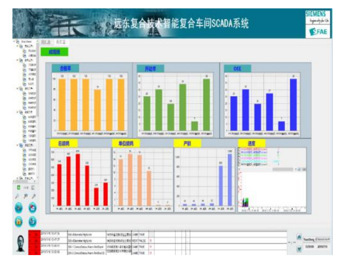
Intelligent workshop--Data analysis of equipment energy consumption