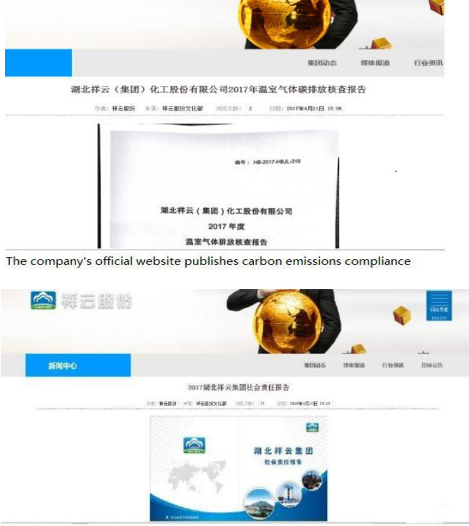
The company's official website publishes social responsibility reports

The company publishes the company's carbon emission performance through the company website and the website of Hubei Carbon Transfer Center, and publishes the social responsibility report every year. It also issues social responsibility reports to the public through reports to relevant government departments and online publications. Explain the implementation of stakeholder responsibilities, especially the implementation of environmental social responsibility, and the report is publicly available.