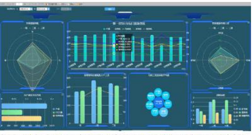
Statistics, analysis and comparison of various types of energy consumption in the operating tear

Energy visualization management. Implementation of real-time energy data acquisition, automatic calculation of energy input and output, transmission balance, on-line monitoring of energy efficiency, fast and accurate feedback of energy loss in each link, at the same time through video surveillance of key areas, PC and mobile phone two ways to achieve a comprehensive monitoring of the production process of energy use, fast and efficient energy scheduling management, improve energy utilization Rate.