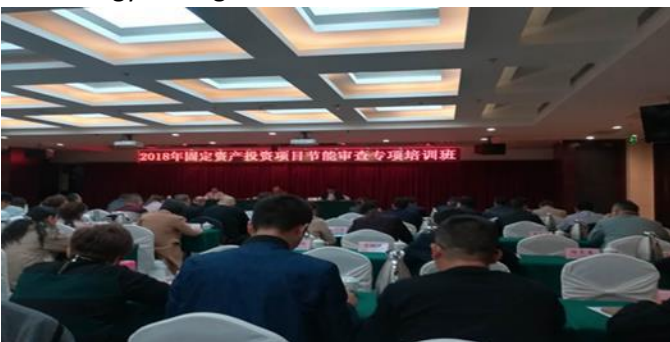
Figure 3: training