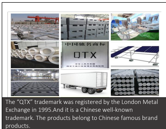
The "QTX" trademark was registered by the London Metal Exchange in 1995. And it is a Chinese well-known trademark. The products belong to Chinese famous brand products.

A state-owned key enterprise of China Nonferrous Metals Industry