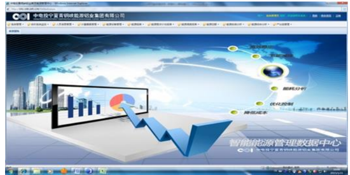
Figure 1: the energy management data center