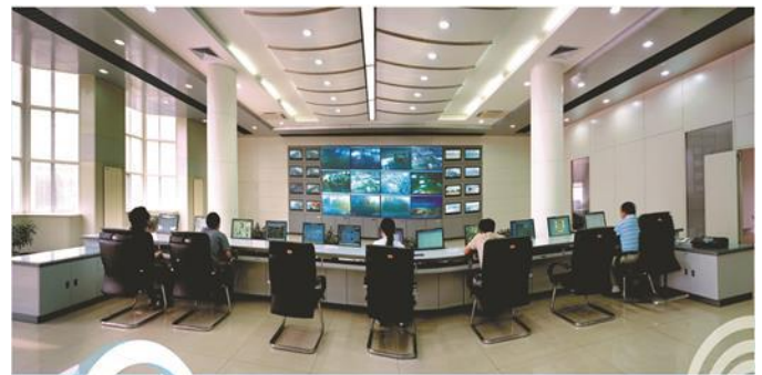
Figure 4: dispatch center

gets obvious economic benefits by operation mode of overall arrangement. The annual average energy saving reached 9,592 tce. At the beginning of each year, we will formulate energy consumption limit indicators and unit consumption indicators for each process product, and decompose energy consumption into various units on a monthly basis. Each month we will make statistical analysis of energy consumption, for monthly assessment of units exceeding the target limit, and the wages are closely linked to monthly performance.