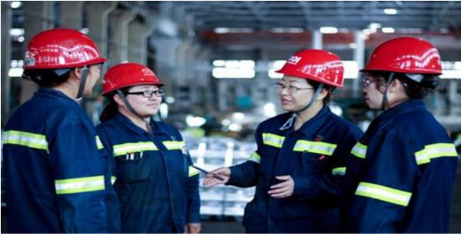
Figure 2: actual arrangement