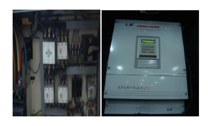
Installation of inverters in place of star delta starter