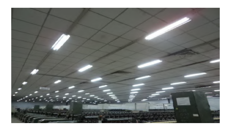
LED tube lights at Worsted spinning Department.