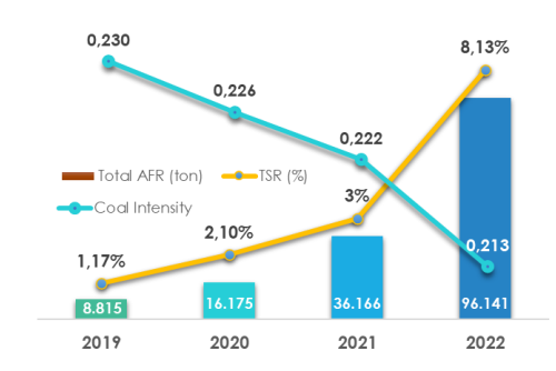
Figure 5. Thermal Subtitution from biomass and coal intensity

Agricultural Waste Reduction (Renewable Energy) - Agricultural waste (biomass) is used as an alternative fuel to replace coal consumption. The thermal substitution rate (TSR) of biomass increased significantly from 1.17% to 8.13% between year 2019 and year 2022 (Figure 5), with a total amount of agricultural waste utilized of 157,297 tons. If this waste is unused, it will be burned by the community, causing environmental pollutants such as Particulate Matter (M. O. Andreae, P. Merlet, 2021). This increasing usage of biomass does not affect the quality of products due to adjustments are made to the raw mix design and COP (Critical Operating Parameters).