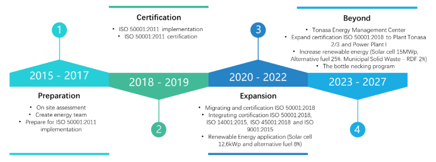
Figure 2. The Process of Implementing an ISO 50001 & Roadmap Semen Tonasa

the energy teams from various work units. In this early phase, we get support from an external consultant. The ISO 50001:2011 certification was obtained in 2019 and then migrated to ISO 5000:2018 in 2020. Further improvement made by integrating ISO 50001 with other management systems by 2021 (Figure 2).