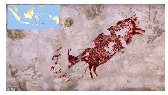
Fig 3. Prehistoric paintings at Bulu Sipong site

Tonasa plant located in the protected national park area and there has a few pre-historic sites, one of them is the Bulu Sipong which had one of the oldest paintings in the world (45,500 years) and a part of UNESCO Global Geopark. Reducing pollutans & emissions through energy efficiency is one of the company's contributions to protect flora and fauna existence in Geopark.