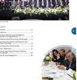
Clean Energy Ministerial Releases CEM7 Roundtables Summary