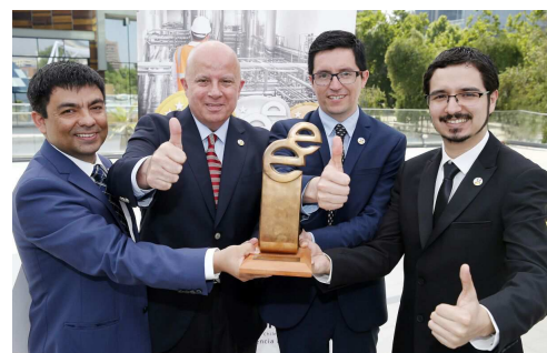
Figure 1: Achievement of the Energy Efficiency Golden Award.

The positive results of the implementation of the energy efficiency projects helped Bci to obtain the Gold Energy Efficiency Seal granted by the Ministry of Energy. This award is given to leading national companies who promote energy matters such as culture, responsibility and commitment.