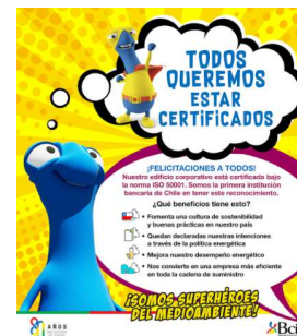
Figure 5: Publicity slogan

The EnMS team has also developed, with the support of communication agencies, an annual dissemination plan focused on developing awareness campaigns, in which the team provides information to employees regarding the improvement in energy performance.