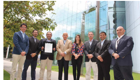
Figure 3: ISO 50001 Certification.

The Bank achieved the ISO 50001 certification in December 2016. This was possible due to the commitment of senior management team and the EnMS Team.