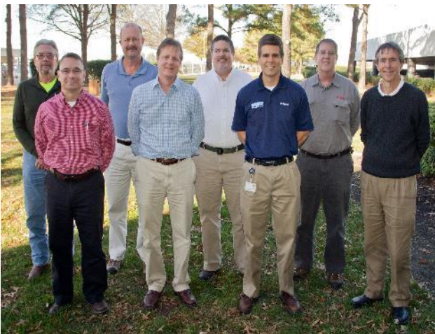
Members of the Nissan North America Energy Team at the Smyrna, TN facility.

Nissan's Energy Team, with support from the plant's Facilities Engineering department, modeled the EnMS after its existing management system for the environment (ISO 14001).