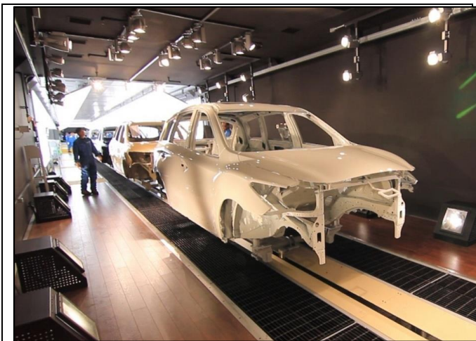
Nissan's vehicle assembly plant in Smyrna, Tennessee, is the first U.S. passenger vehicle plant to achieve ISO 50001 and U.S. Superior Energy Performance (SEP) certification.

Automaker improves energy performance 25% over Six Years with SEP