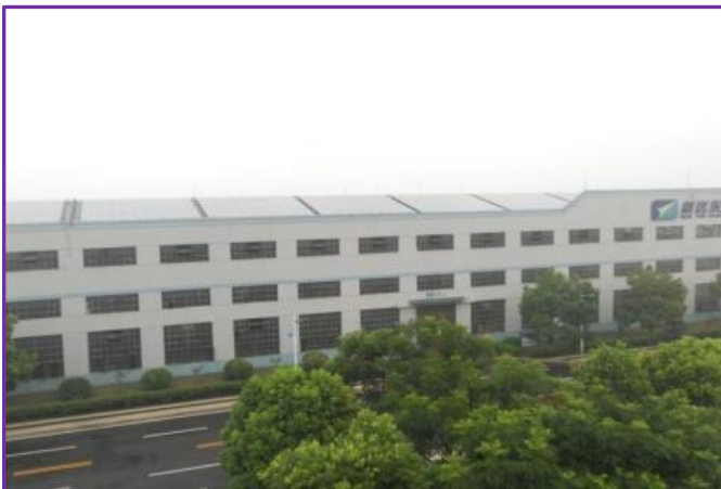
Construction of photovoltaic power station

The intelligent workshop project has been implemented for two years, and there is still much room for improvement. In the next 1-2 years, we will continue to work with Siemens to further explore the potential. APS intelligent production scheduling, MES terminal QR code scanning, quality process online monitoring, equipment status automatic monitoring feedback and other systems will be implemented in succession.Through intelligent transformation, the unmanned and black light factories will be realized. In the next 3-5 years, the intelligent transformation of the whole company will be realized from point to surface.