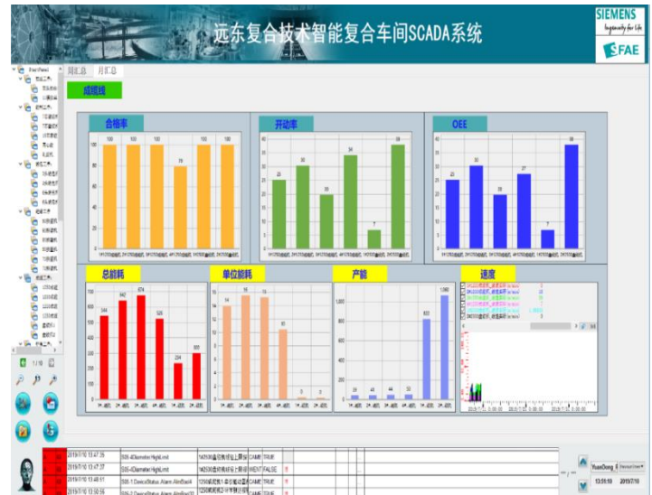
Intelligent workshop--Data analysis of equipment energy consumption