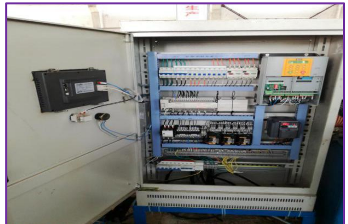
Equipment frequency conversion transformation