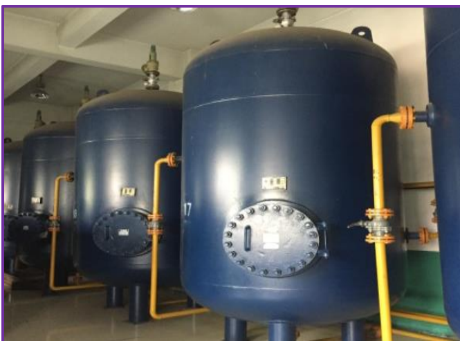
Centralized control transformation of air compressor station