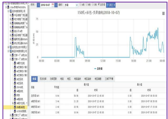
Power monitoring platform