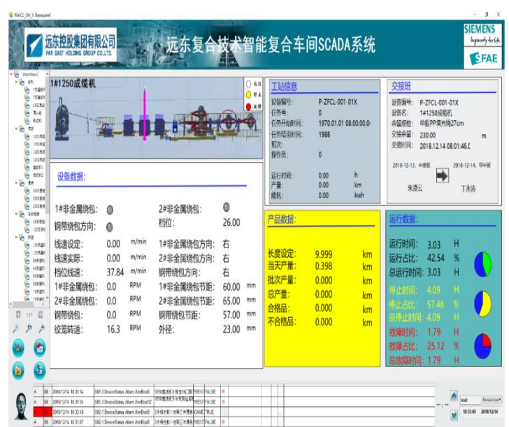
Intelligent workshop---Equipment data collection