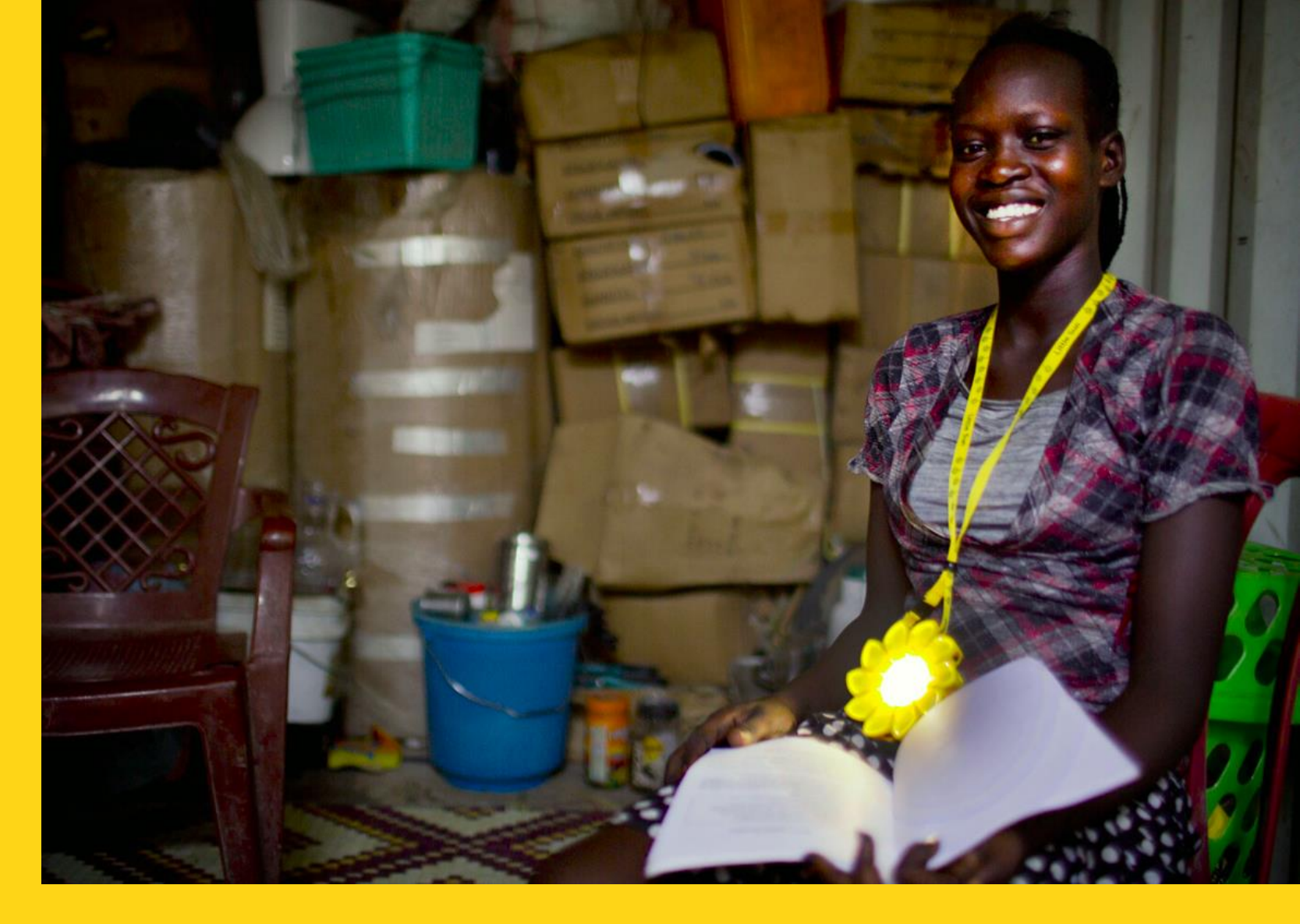
"My Little Sun goes with me everywhere, it's lighting my future."