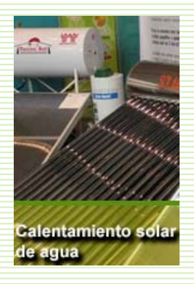
Solar water heating