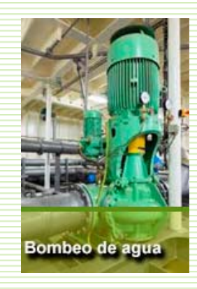
Water pumping systems